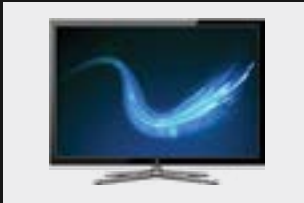
TV & Streaming